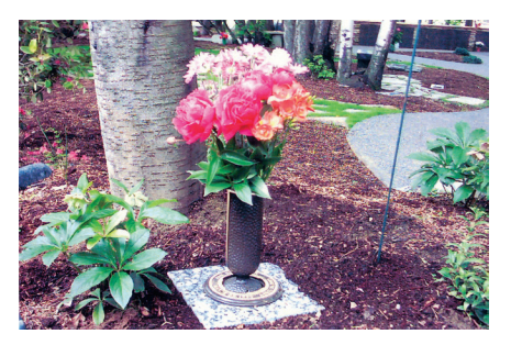
Stillwaters, located within Greenacres Memorial Park, with its complete funeral home and on-the-grounds cremation facility, is minutes from Bellingham, downtown Ferndale and Lynden, WA.

Moles Bellingham 2465 Lakeview Drive, Bellingham, WA 98229 360-733-0510