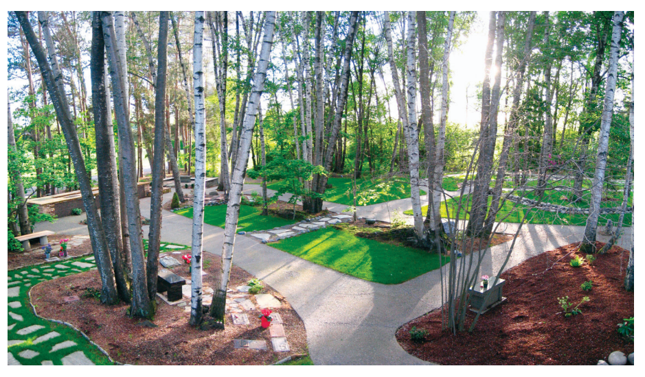
Stillwaters' quiet wooded setting, cascading stone waterfall, calm reflecting pond, stone paths and meandering streams all create a sense of comfort and peace.

Stillwaters Cremation Cemetery provides a beautiful and peaceful location designed specifically as a perpetual resting place for cremated remains.